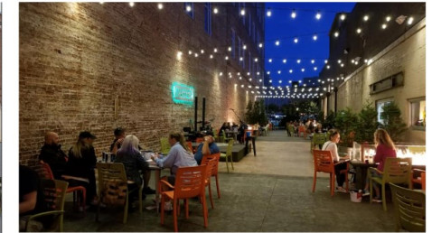
located at 809 Third Avenue in Downtown Huntington, WV.

The Market is a popular indoor market featuring an eclectic mix of stores, shops, and restaurants. Find unique one-of-a-kind gifts for everyone in the family. Enjoy hot chocolate from Butter it Up, purchase Ice Cream Pies from Austin's Ice Cream. Find something for the fashionista at the Hip Eagle Boutique. Stop and look around Wildflower Gift Gallery. All kinds of fun is happening at The Market, from live music to Marshall University hundering Herd game watching parties, to wine tastings, and pretty much anything you can think of in-between!